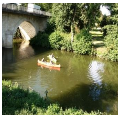
Privative bank for fishing and kayaking

In the heart of the Bergerac vineyards, we welcome you in our renovated air-conditioned cottage, in the superb bastide of Eymet.