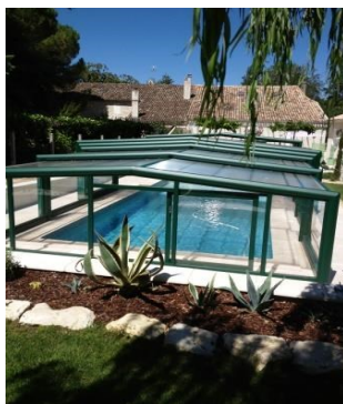
Large swimming pool of salted water, with a removable shelter and various deep levels, to relax and cool.