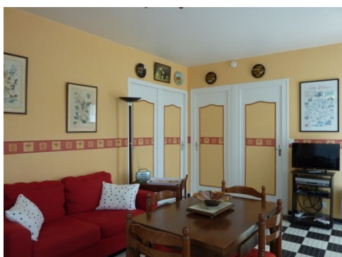
Very bright living room. TV, Internet. View on the swimming pool and te Dropt