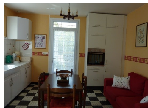
Fully equipped kitchen, Dishwasher, oven, microwaves, coffee-maker