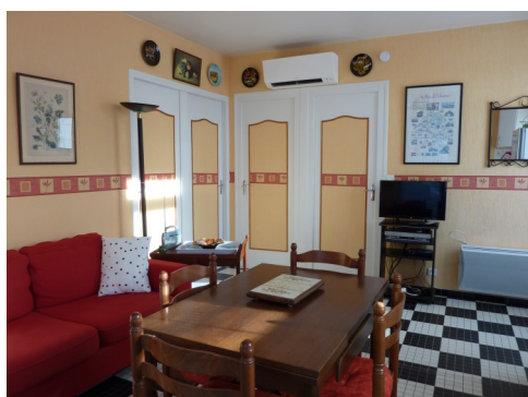
Very bright living room. TV, Internet. View on the swimming pool and te Dropt