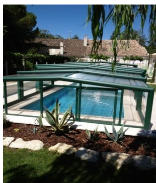
Large swimming pool of salted water, with a removable shelter and various deep levels, to relax and cool.