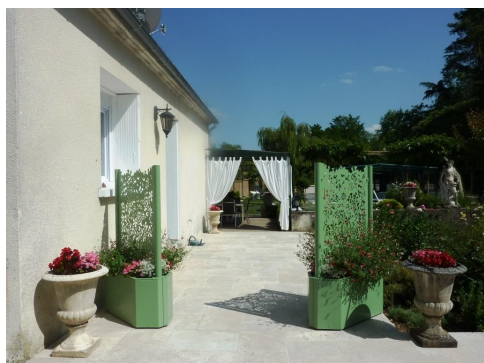
Big terrace, well-kept enclosed garden