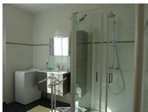
Bathroom with italian shower, Washing machine. View over the river and the swimming pool.