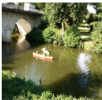
Privative bank for fishing and kayaking

In the heart of the Bergerac vineyards, we welcome you in our newly renovated house, in the superb bastide of Eymet.